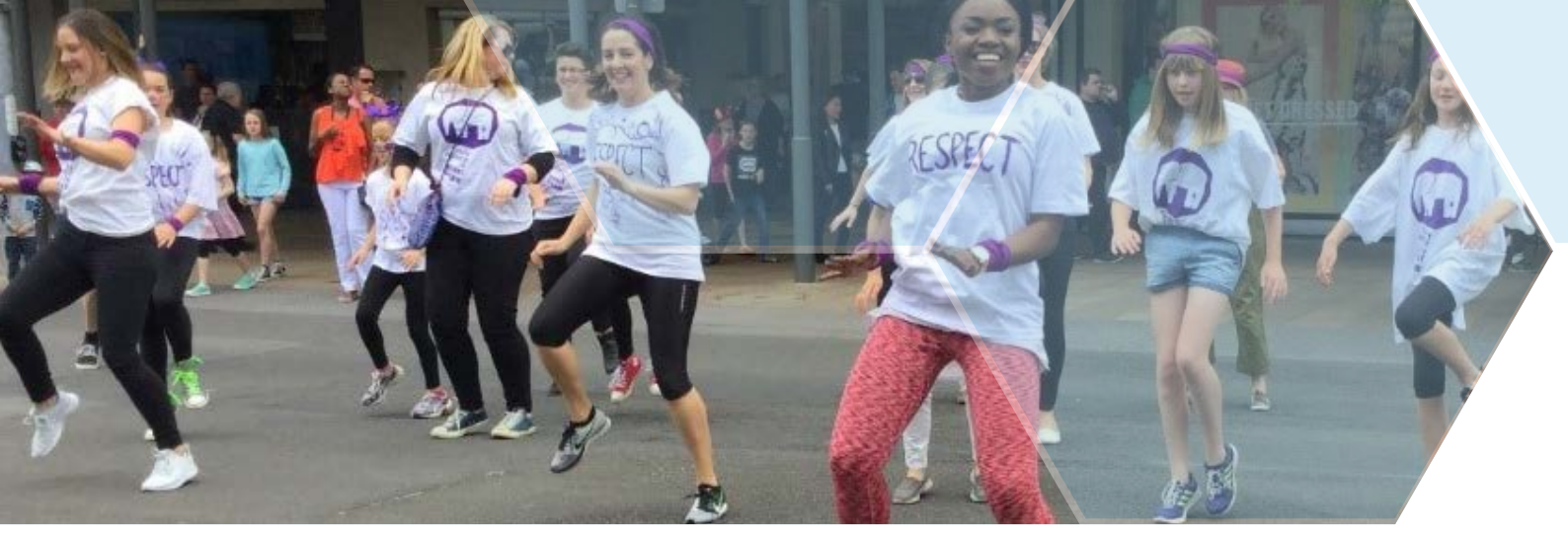
Our fabulous FlashMob Crew, 2016